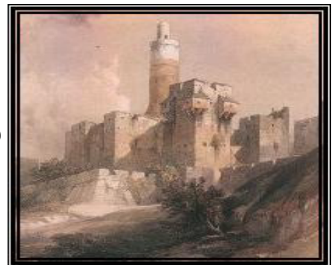
Rebuilding the Jerusalem Wall