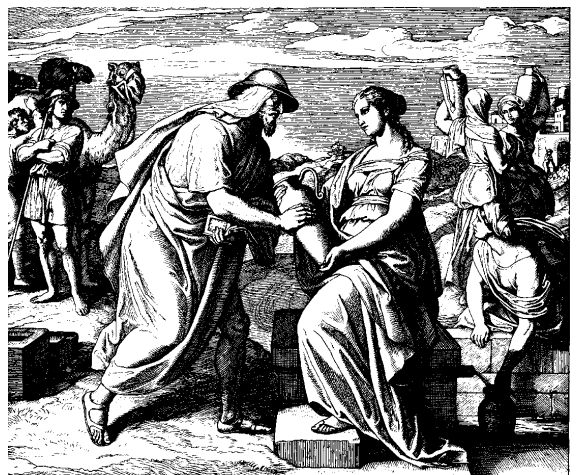
Abraham's Servant Meets Rebekah

than is required or expected, and the heart to do so, with motives that are pure and not self-seeking. Amen