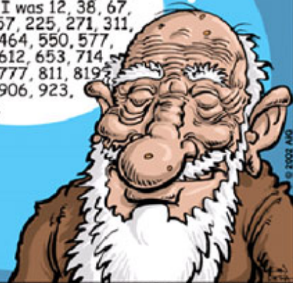
Methuselah on New Year's Day.